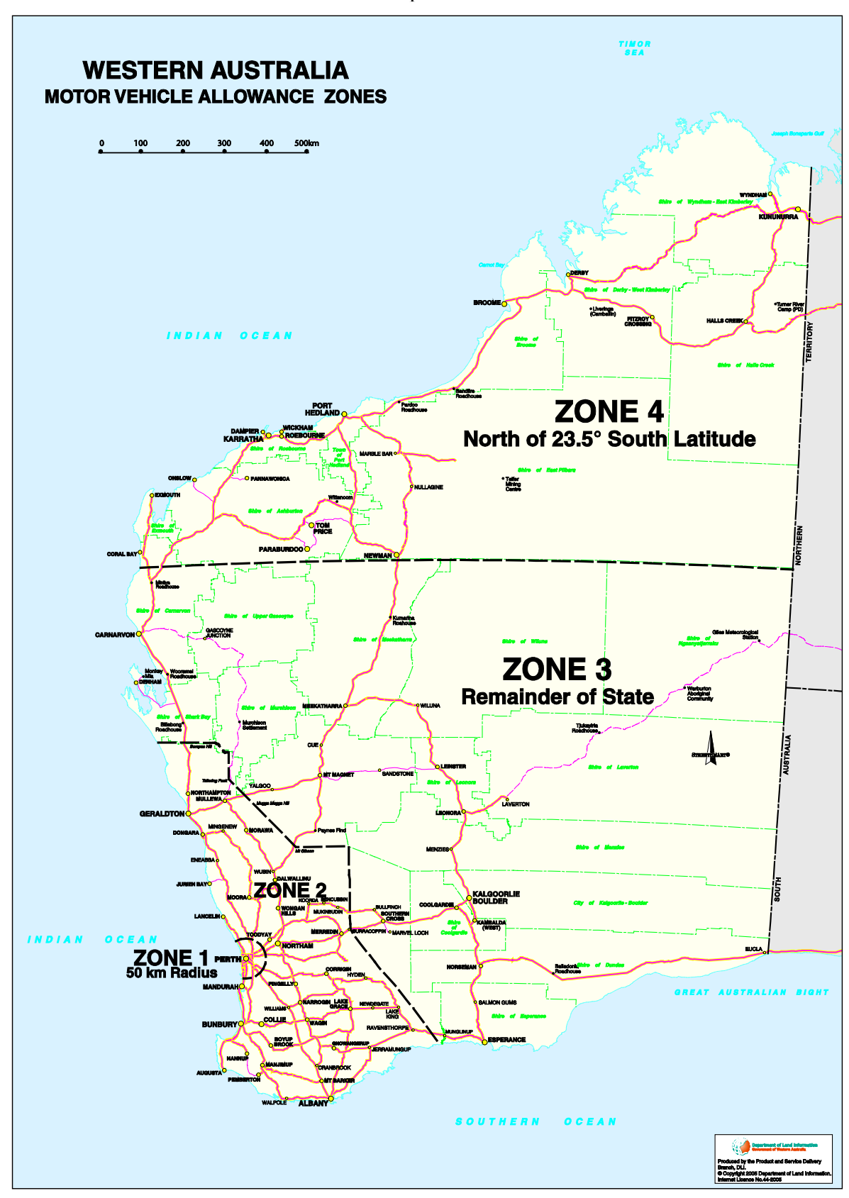
Part 4 – Motor Vehicle Allowance Zone Maps