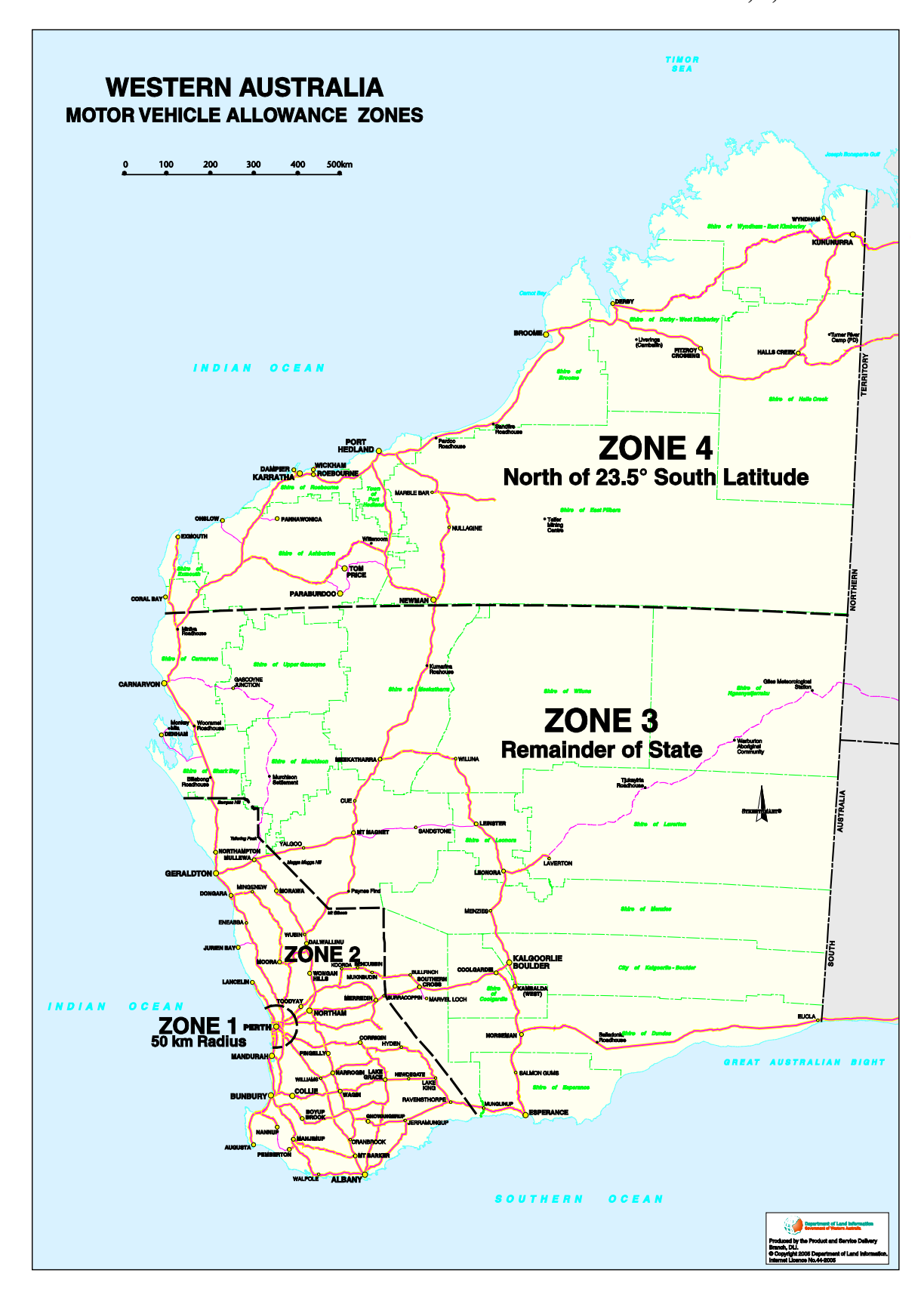
SCHEDULE 6 - MOTOR VEHICLE ALLOWANCE MAP - ZONE 1, 2, 3 & 4